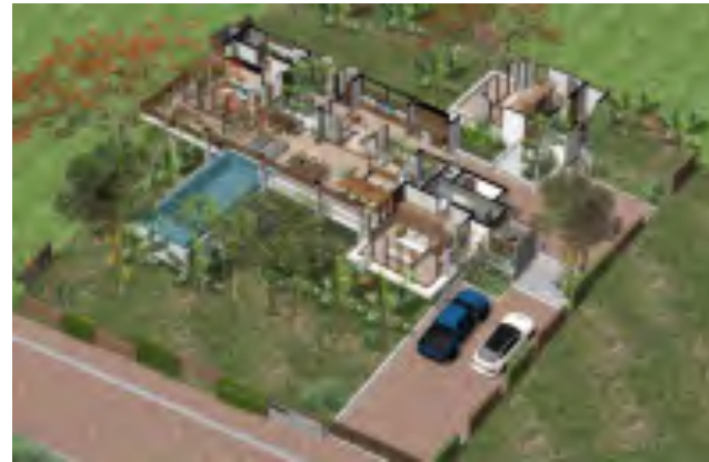
DAMNAK VEJO SORIYA – EXTENDED